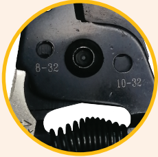
Shear 8-32 and 10-32 gauge copper screws