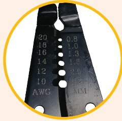
Strips 20, 18, 16, 14, 12, and 10 AWG wire