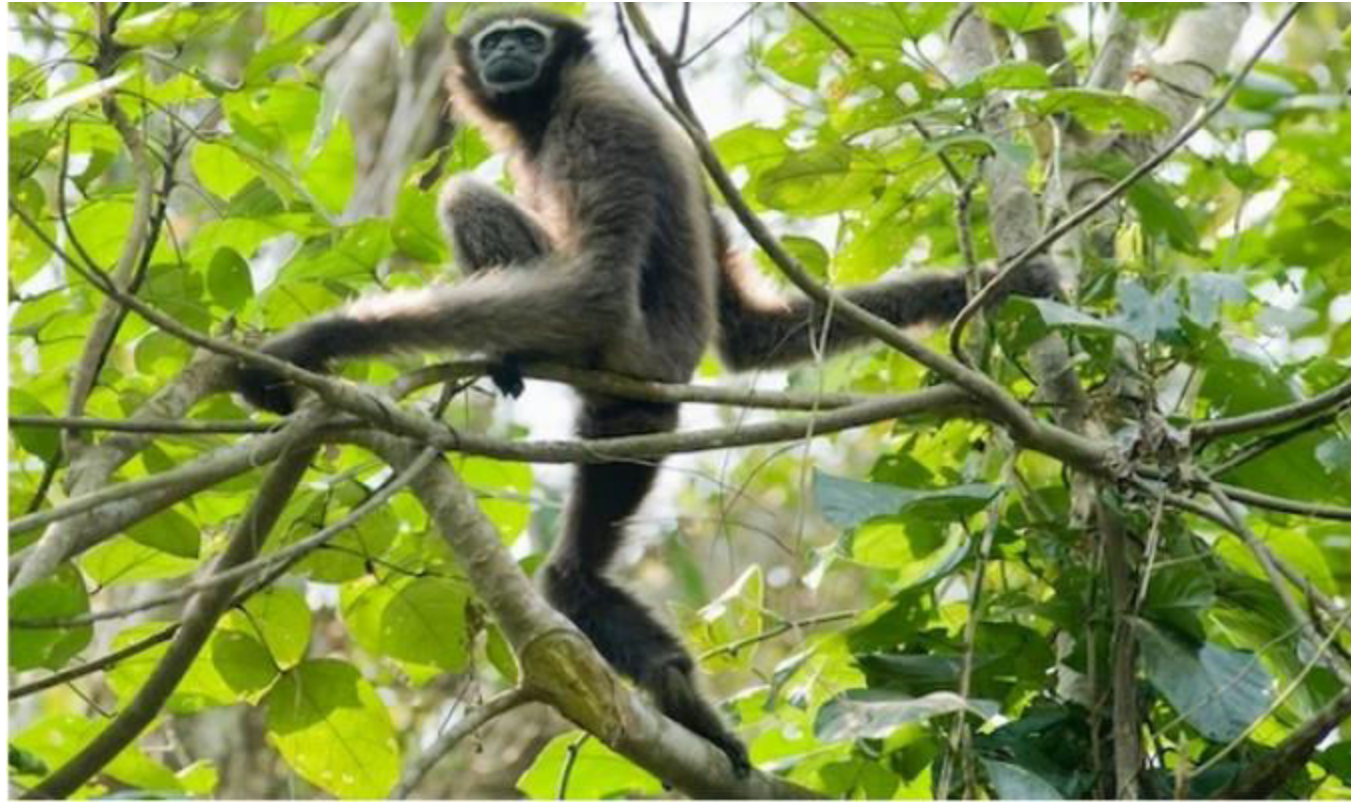
Young female Western Hoolock Gibbon.

Of the world's 25 biodiversity hotspots, two are in India: one along the