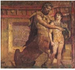
Chiron and Achilles in a fresco from Herculaneum (Museo Archeologico Nazionale, Naples)