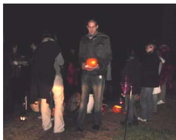
A Midnight ritual is commonly held to mark the Samhain celebration

Merry Greet and welcome to Issue 3 of Pagan Voice, a free newsletter produced by local pagans. In this issue we have Part II on the origins of Paganism, the first part of Chiron: the wounded healer and a new glossary section, plus our regular features. Wishing all of our readers a Happy Samhain!